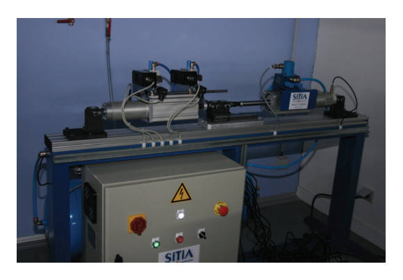
Fig. 1: [10] the electropneumatic system - On the left hand side is the "main" actuator whose its position is controlled. On the right hand side is the "perturbation" actuator whose load force is controlled.

The electropneumatic system used for the controllers evaluation consists in two actuators which are controlled by two servodistributors (see Figure 1).